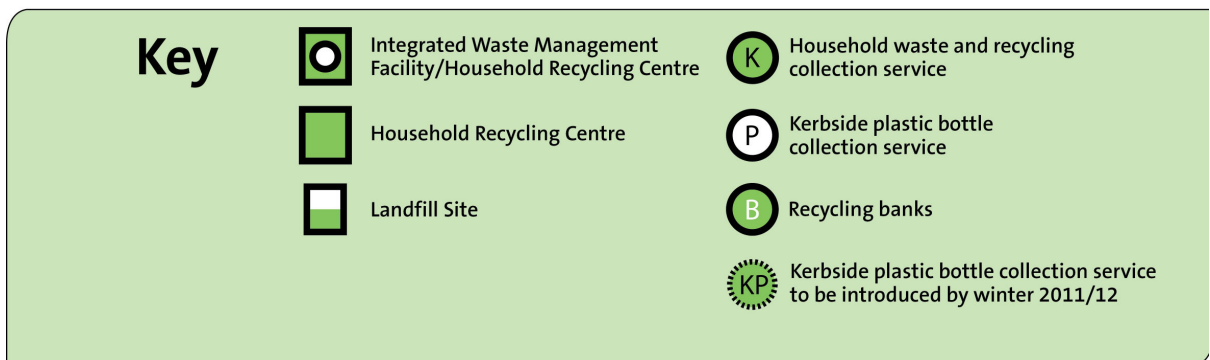
Figure 1 Shropshire Waste Management Facilities